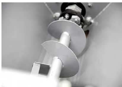
Two Joint Discs for Smooth Rotation