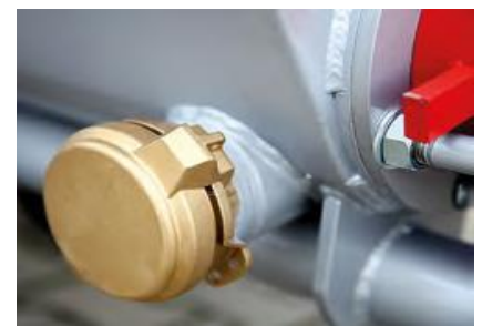
Large Opening for Cleaning

* Worm Pump * Grout Machine * Mortar Pump * Floor Screed Equipment * Liquid Screed Pump * Fine Grained Concrete Pump *