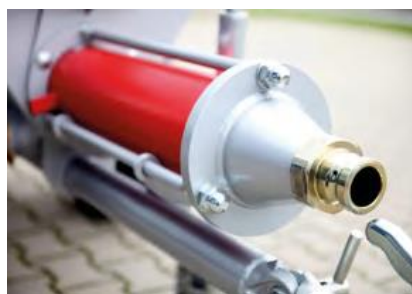
High Volume Worm Pump